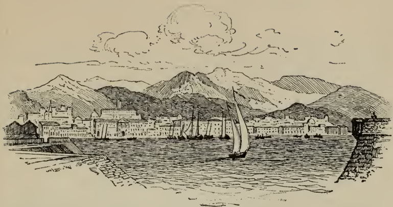
MESSINA FROM THE SEA